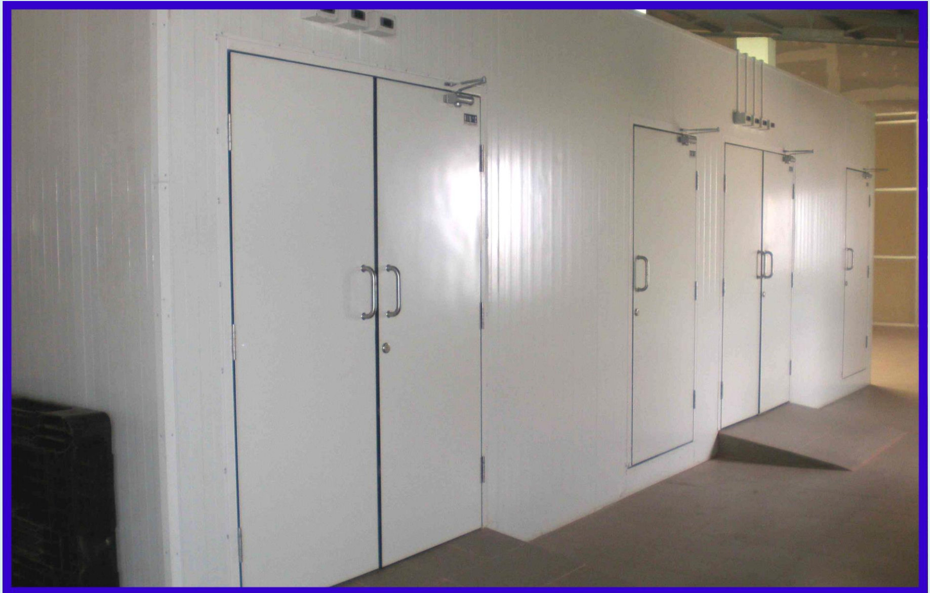
Cold Rooms at Verna – 2 nos. with an area of 2000 sq. ft.