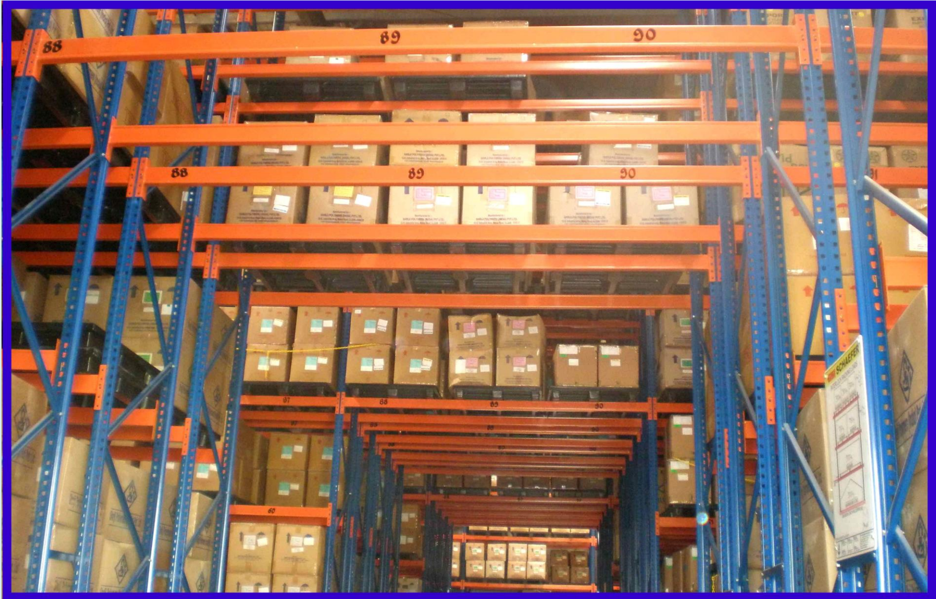
Double Deep Racking System by Schaefer for our pharmaceutical client