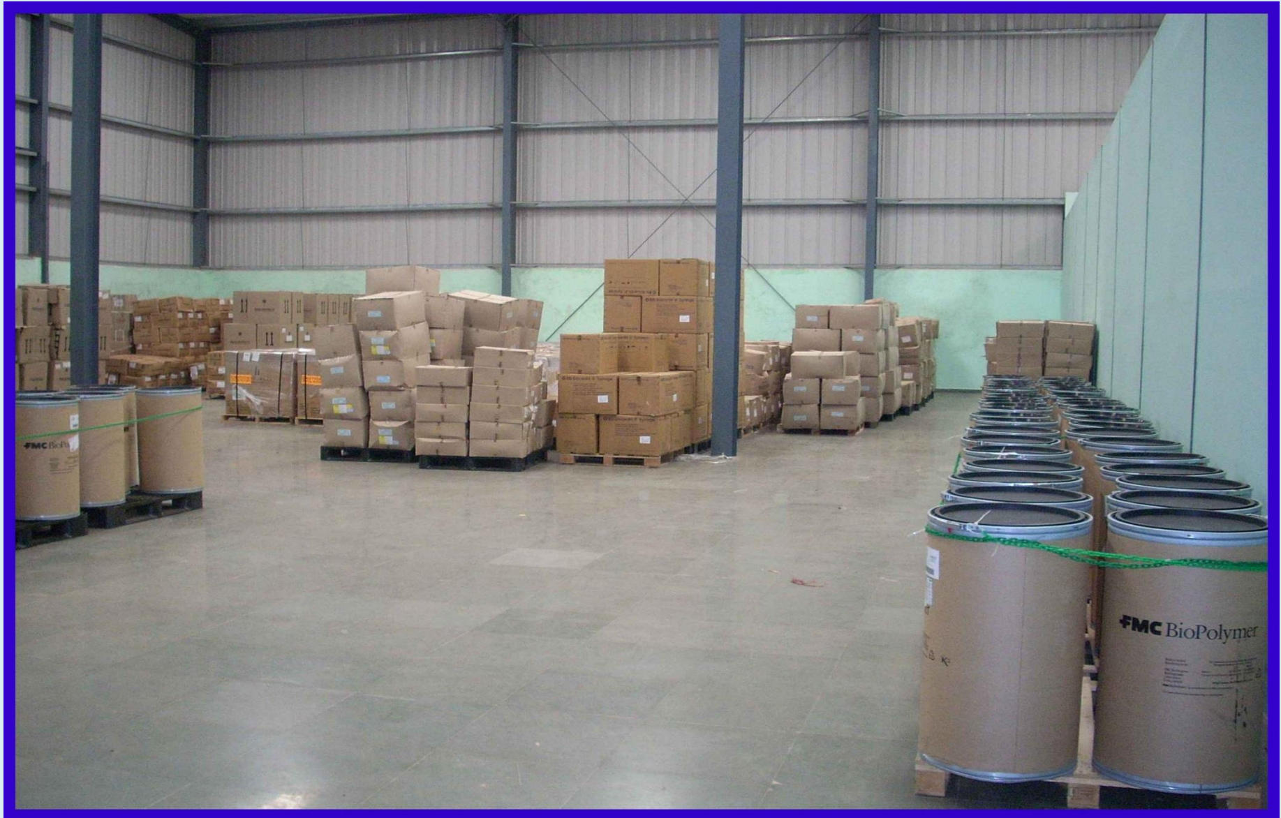
Material stored for a leading pharmaceutical client