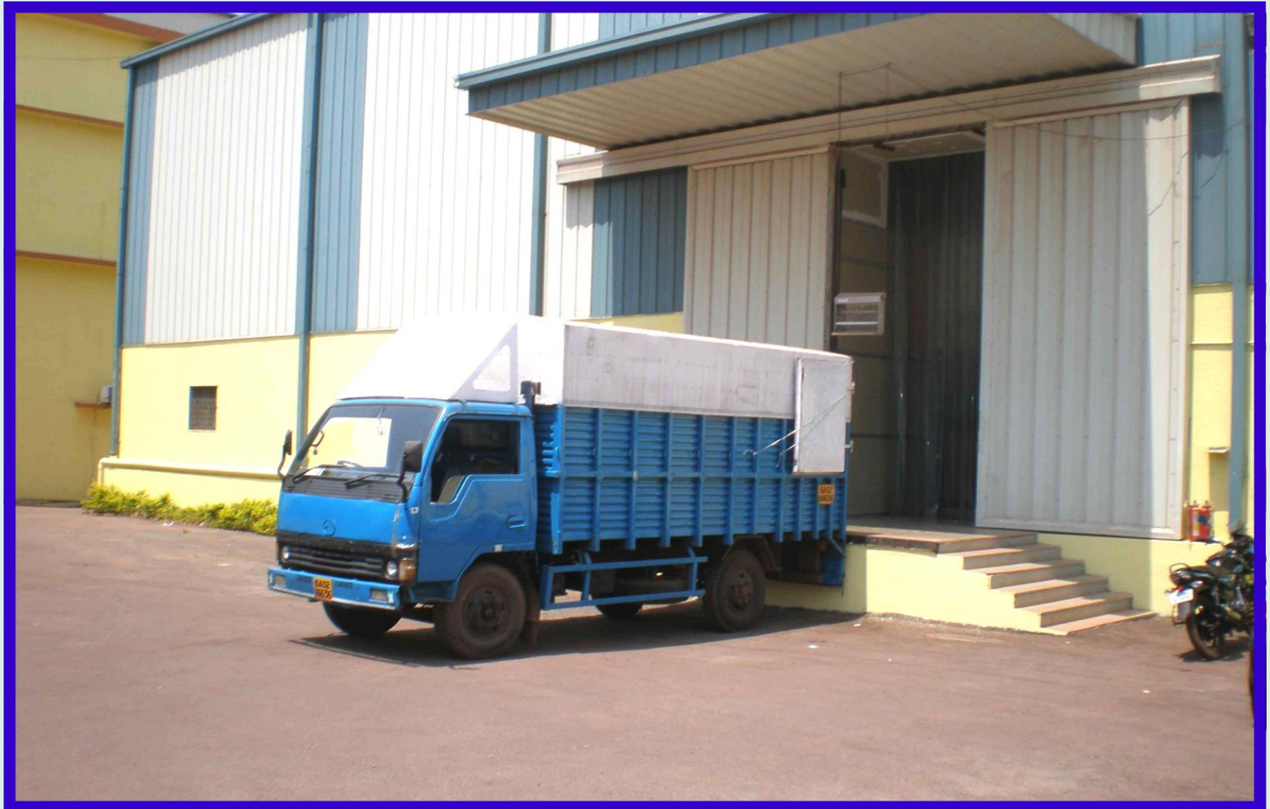
Entrance of one of our Warehouses in Verna, Goa