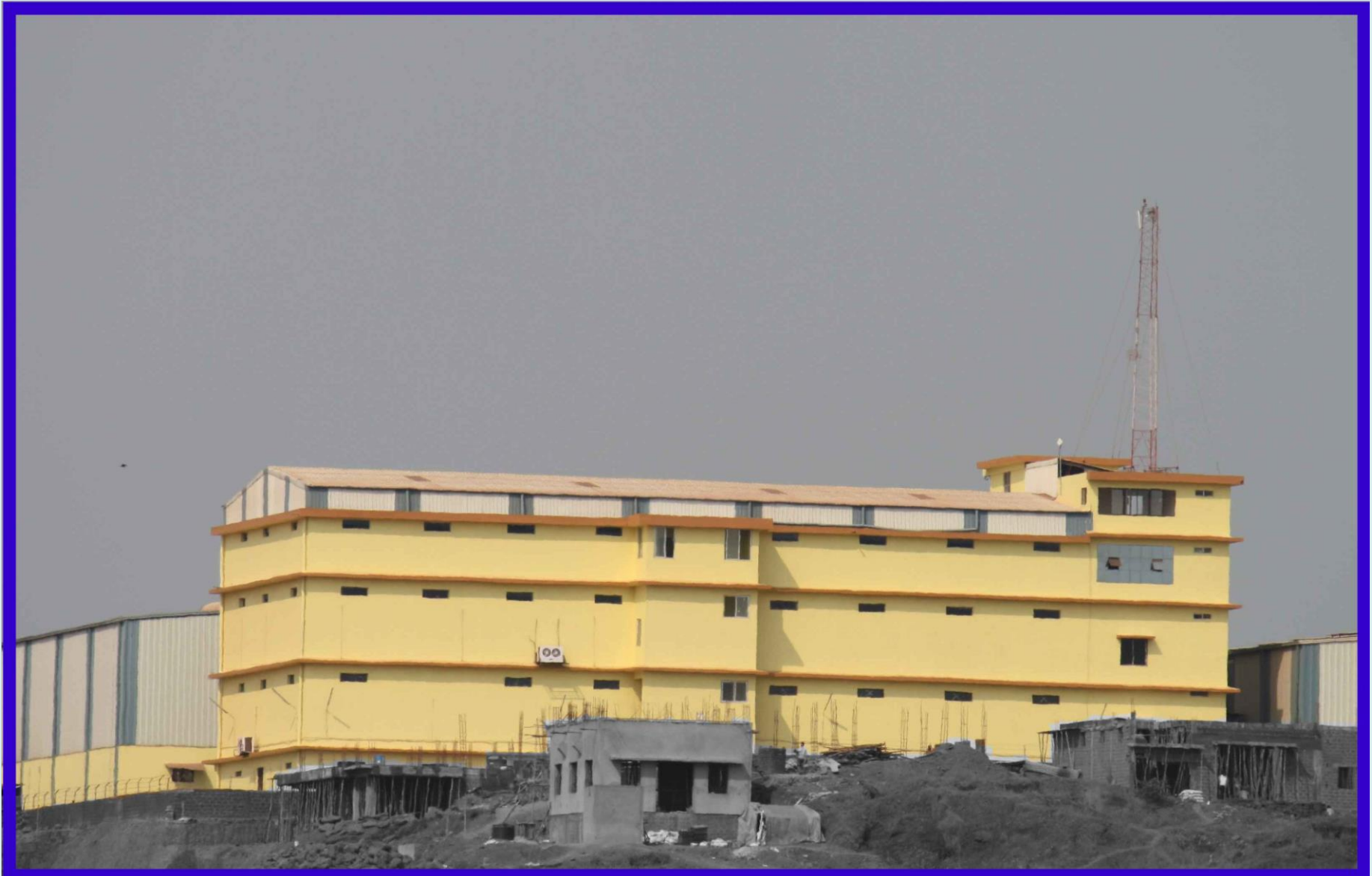
Our Verna Warehouse Facilities