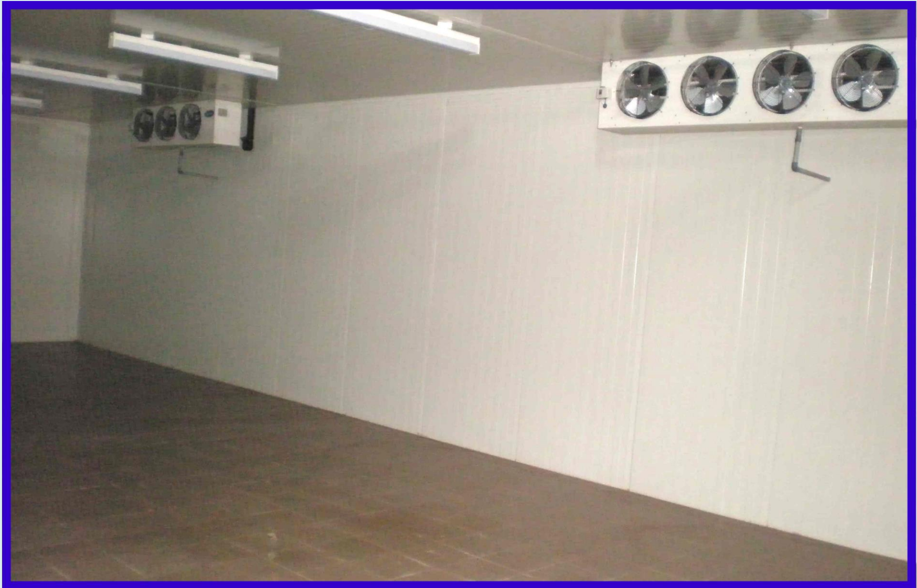
Inside view of one of our Cold Rooms