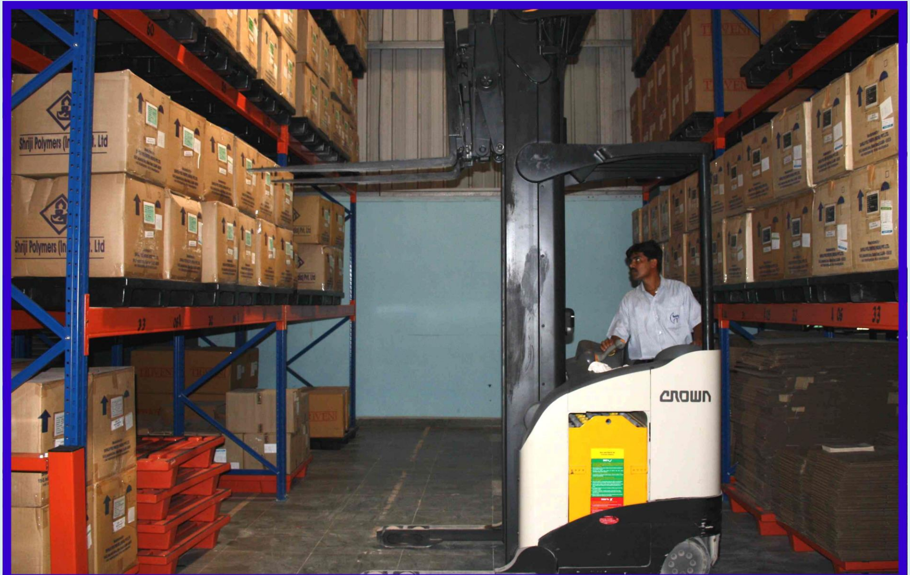
Crown Double Deep Reach Truck in Operation for our pharmaceutical client operations 11