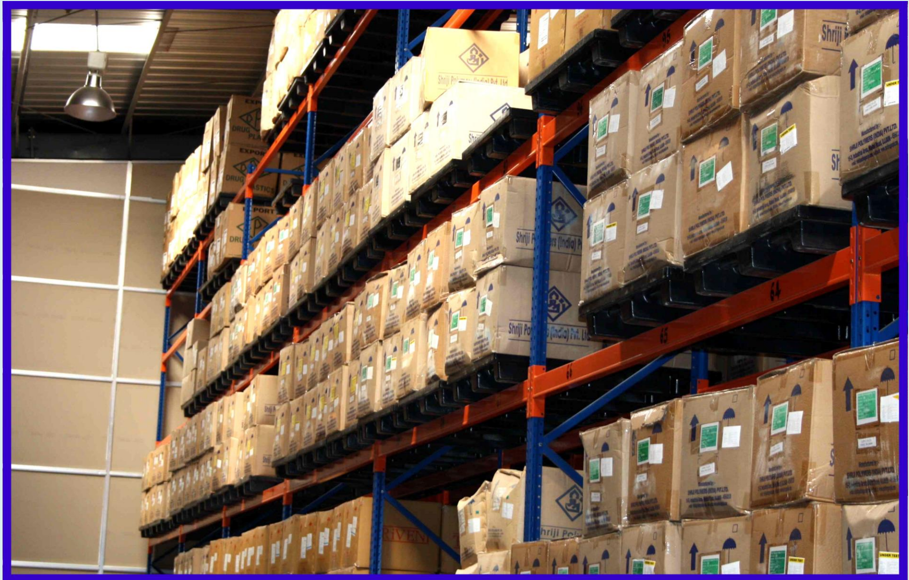
Double Deep Racking System by Schaefer for our pharmaceutical client