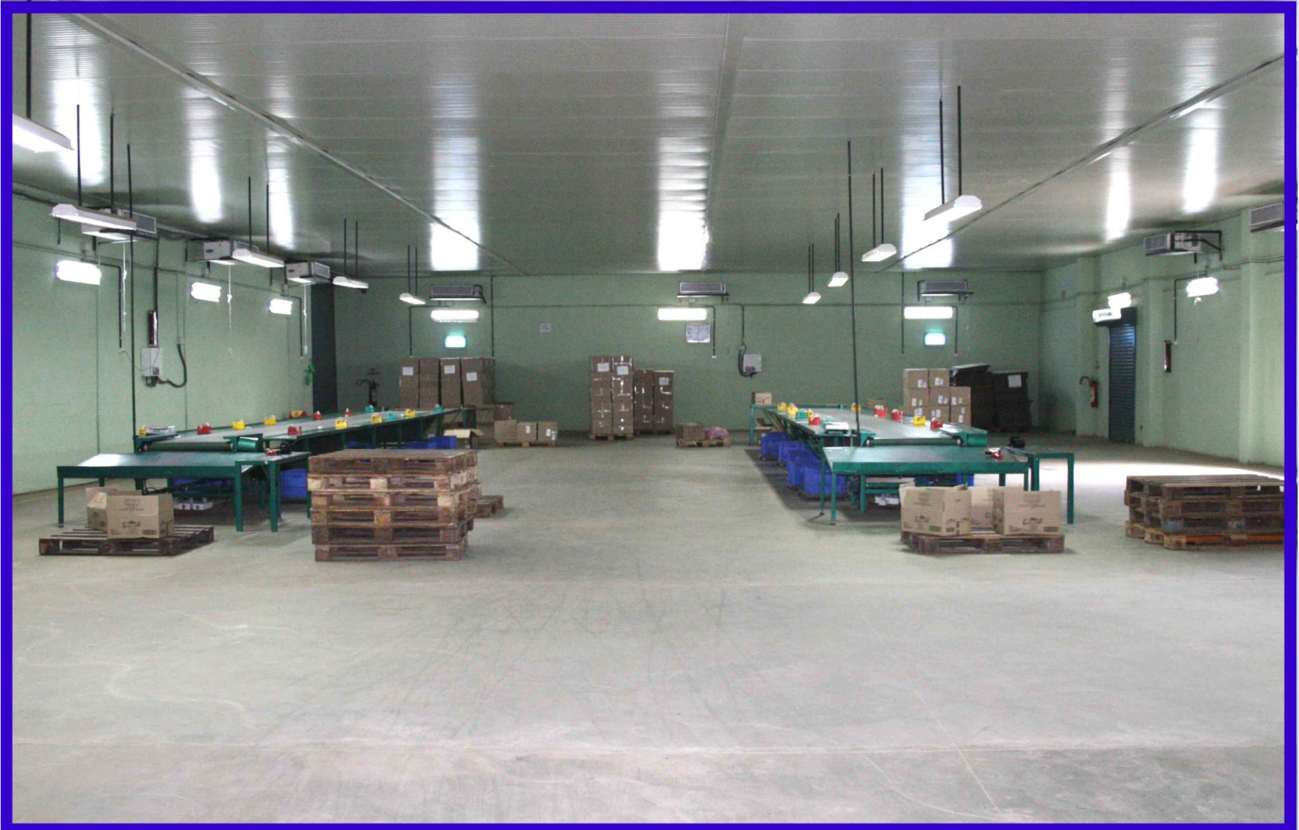
Climate controlled secondary packing of chocolates at our Cuncolim Facility